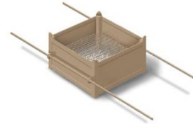
Altar of Burnt Offering

Copyright 2008 Logos Bible Software/ Artist Jeff Goertzen