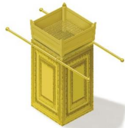
Altar of Incense

GRAPHIC BY KARBEL MULTIMEDIA, COPYRIGHT 2008 LOGOS BIBLE SOFTWARE